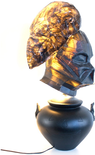
Daniel Klaas Beckwith artifacts left by a vanishing body , 2017 (lamp) four channel audio, moped, lamp, fabricated rock variable dimensions DKB4