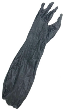
Daniel Klaas Beckwith spooky trash , 2017 plastic, paper (6 objects) various dimensions DKB8