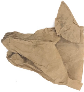
Daniel Klaas Beckwith spooky trash , 2017 plastic, paper (6 objects) various dimensions DKB10