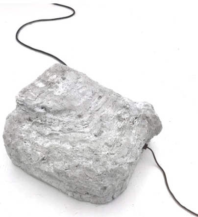
Daniel Klaas Beckwith artifacts left by a vanishing body , 2017 (rock) four channel audio, moped, lamp, fabricated rock variable dimensions DKB3