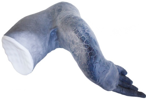
Daniel Klaas Beckwith monster arm , 2016 plaster 4 x 15 x 7 inches (10 x 38 x 18 cm) DKB6