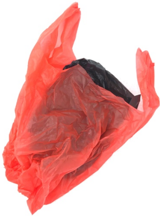
Daniel Klaas Beckwith spooky trash , 2017 plastic, paper (6 objects) 3 ½ x 14 x 10 inches (9 x 36 x 25 cm) DKB7