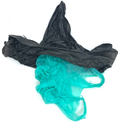
Daniel Klaas Beckwith spooky trash , 2017 plastic, paper (6 objects) 3 ½ x 20 x 18 ½ inches (9 x 51 47 cm) DKB9